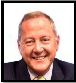
Glen McDonald Airport Authority