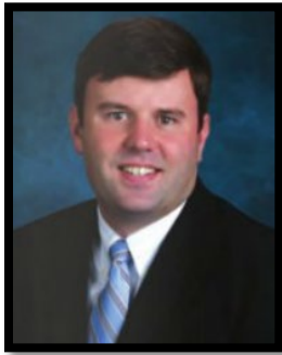
Ben Lee Chair